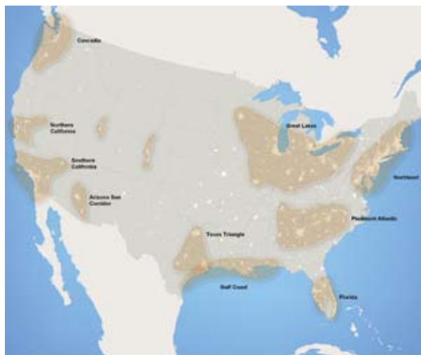
Fig. 1. Mega-Regions in the United States (RPA 2006)

Mega-regions, it has been claimed, are the new competitive units in the global economy. Just as metropolitan regions grew from cities to become the geographical units of the 20 th century's global economy, mega-regions could