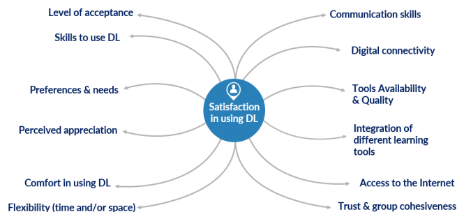
Figure 1. Key factors that affect satisfaction in DL

Despite the key factors that affect DL satisfaction (Figure 1), inequalities or vulnerabilities for some groups/countries greatly affected the continuity and efficiency of the educational process, even more so in times of rapid changes.