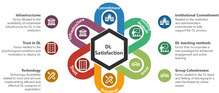
Figure 3. The six factors identified for DL satisfaction