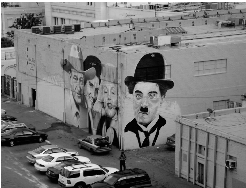
Fig 9. John, Elvis, Marilyn and Charlie , Franklin Avenue, Hollywood, Los Angeles

hood. Monumental portraits of well-known personalities and figures-symbols of pop-culture are also very popular (Fig 9). The heroes of comics Superman , Batman and King Kong compete with heroes from the action movies or cinema stars.