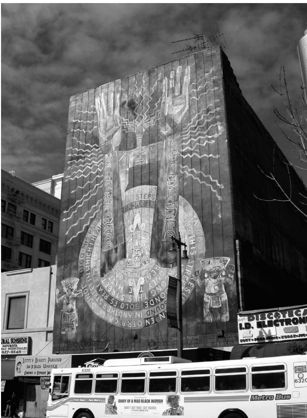
Fig 4. Street of Eternity , 1993, by Johanna Poething, Los Angeles

pe and composition. Another problem is the choice of technique of presentation.