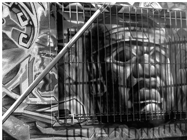
Fig 5. Mural in Mexican district, San Francisco, 2006

people's life from the past. Such images might play a significant educational role. On the other hand, lots of giant pictures have quite a different mood, not always so serious. Building size jokes, optical illusions or just desire of mere decoration and “beautiful look” serve visual entertainment in urban and architectural space (Figs 6, 7). We can find the exemplification of such kind of creativity in almost all historical periods. The importance of its meaning is again appreciated and stressed. The characteristic trends of the second half of the 20 th -century architecture turn towards tradition manifesting itself in historicism, homeliness and regionalism as well as humanization of spatial environment with popular tendencies as one of aspects. Charles Jencks mentions the idea of “the pursuit of humor” [7] as one of the main stylistic values of post-modern architecture, and according to this author, “enjoyment” constitutes the third defining criterion of postmodernism [8].