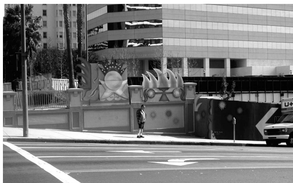
Fig 7. Painted fence, Long Beach, 2005

was believed to have extraordinary or even magic power. Monumental portraits probably could activate an old myth of “enlivening by picture”, functioning since prehistoric man began to create his first drawings on the walls of caves. Anyway, the symbolic expressions of powerful paintings equal in scale with architecture, also impress spectators today. In countries behind “the Iron Curtain” that kind of depicting, especially huge portraits of Lenin in the former Soviet Union and of Ceaucescu in Romania, were made very often and were typical of the so-realistic style. In contemporary murals, gigantic-size portraits often turn the attention of viewers to ordinary people, members of society and not previously noticed by their neighbors.