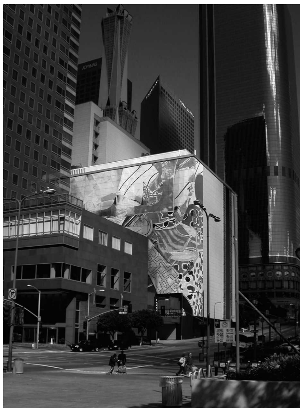
Fig 2. Dusk , 1991, designed by Frank Stella, Los Angeles, 433 Olive St. / Pershing Square

On the other hand, in addition to decorative and formal values, murals usually carry a message and introduce new values to architecture; so to say, they go beyond the architectural frame. Murals open before the audience “new worlds” and “spaces”; they act on their imagination, and “enliven” performances. There is continuity in the history of traditional mural forms from pastiches of Egyptian, Greek, Roman, and Renaissance murals, through pastoral scenes based on the eighteenth-century European gardens or oriental landscapes, to fantasy scenes and faux paint effects. From another point of view, a wide spectrum of mural works also proves that architectural painting mirrors contemporary art