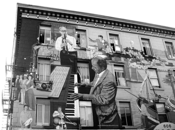
Fig 6. Jazz mural, 1987, by Bill Weber, Broadway-Columbus St., San Francisco

For their scale, color, symbolic meaning and – in some cases – high artistic values, murals work as expressive landmarks in urban space and help to better construct “cognitive maps”. Considering murals as clearly visual dominants, the function of identification could be regarded as a typical formal issue as well. Pragmatic values of mural painting do not exclude the artistic and aesthetical values. The most important aspects of themes represented in paint – regarded as a formal issue – submit the typology of architectural motives, figural scenes, decorative or “environmental” flora and fauna pictures, “quotations” from famous historical paintings. Figural depicting is one of the most frequent and oldest narrative motives. In ancient Egypt, Rome and Mesopotamia the figurative wall painting illusions were widespread, and especially enormous “superhuman scale” depicting