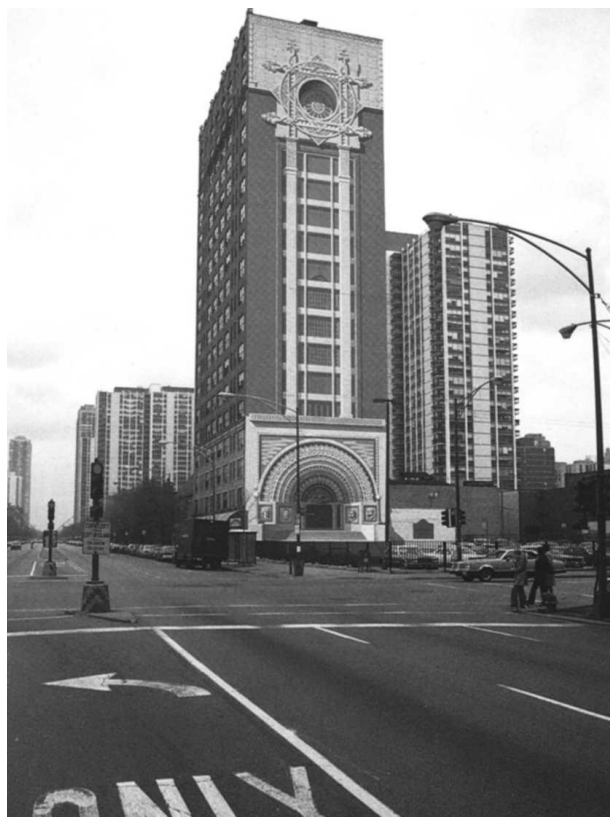
Fig 1. Homage to the Chicago School of Architecture , Richard Haas, Chicago, North La Salle, 1980, source: V. Barthelmeh, Murschilderingen , Meulenhoff, Landshoff, Amsterdam, 1982

Since mural painting always exists within an architectural context and represents in fact a specific form of architectural color, it could never be perceived as absolutely autonomic art. Basic formal issues expose the interrelation between architecture and painting, like domination, subordination or harmonization, stressing deformation and interference in the tectonics of a setting, including change of scale, change of horizon, deformation of vertical direction, illusion of space, and illusion of architectural ornament [4] (Fig 1).